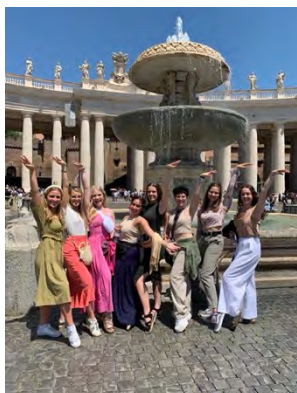
Dance students visit to Rome, Italy with Cortona Dance Program, 2022

Dance majors have also participated in the UGA at Oxford Program for a full semester and for the summer program. The University of Georgia offers its students over 100 faculty-led study abroad programs and more than 50 exchange programs. The UGA Office of International Education assists UGA's international engagement through international collaboration with universities and institutions worldwide. For more information, go to: https://globalengagement.uga.edu