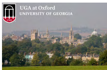
UGA at Oxford